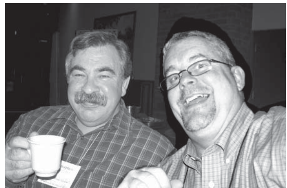
... just a couple of art teachers having a good time.